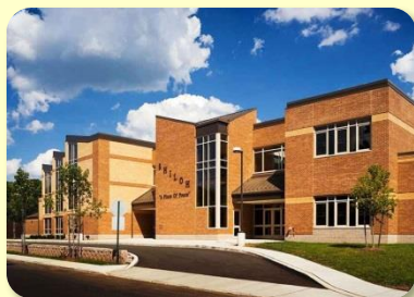
Shiloh - Today