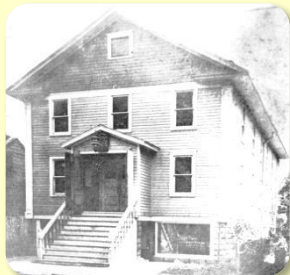
Shiloh 1900's - 1930's