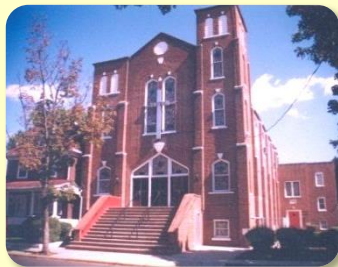
Shiloh 1930's - 2003